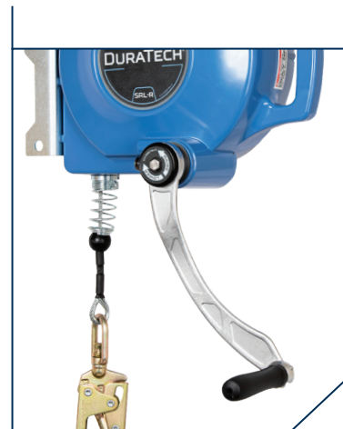
Handle shown in use position

ANSI Z359.12 compliant load indicating swivel snaphook