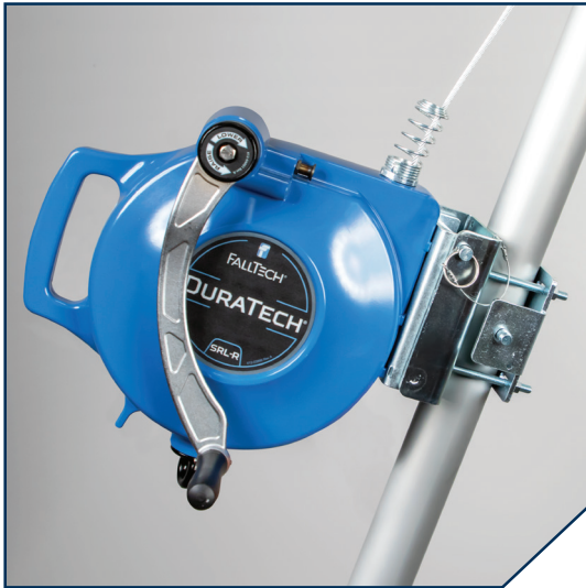
SRL-R shown mounted on a Tripod System (7275)